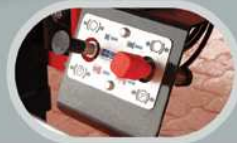
Brake Control Panel