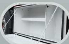
Tool Box 150 cm (2 pcs.)