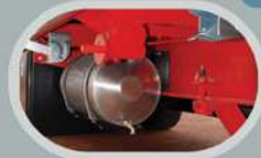
Stainless Steel Water Tank (60 lt)