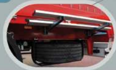
Basket Type Spare Wheel Carrier for Two Wheels