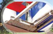
Moving Roof Rear Cap