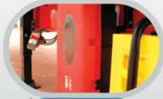
Fire Extinguisher Box