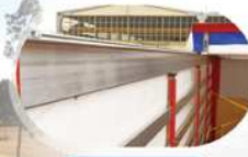
Aluminium Rail System (Rail de Transporte Chassis)