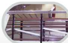
Double Deck Carrying System