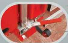
Curtain Sider Spanner Mechanism