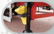
Wheel Check and Landing Gear