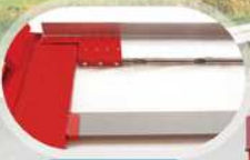
Rail Connection System