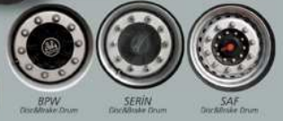
BPW Disc Brake Drum